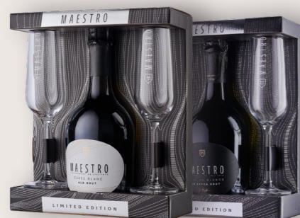
SET VIN SPUMANT MAESTRO WINE + 2 BOHEMIA GLASSES