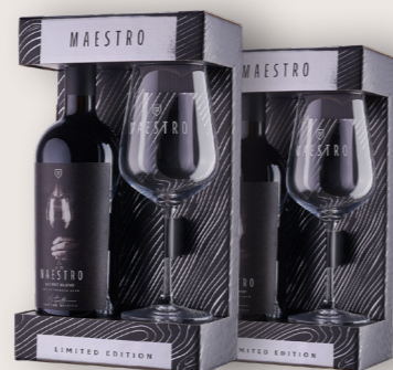
SET VIN MAESTRO WINE + 1 BOHEMIA GLASS