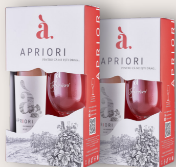
STILL WINE SET APRIORI WINE +1 BOHEMIA GLASS