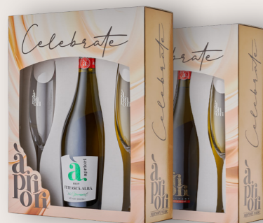
SPARKLING WINE SET APRIORI WINE + 2 BOHEMIA GLASSES