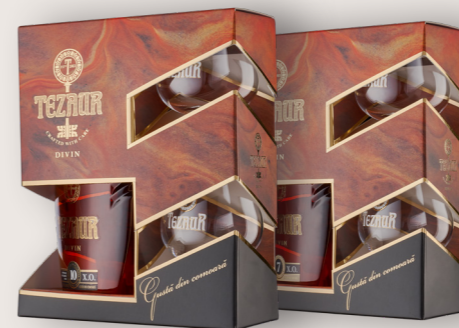
DIVIN TEZAU SET + 2 BOHEMIA GLASSES