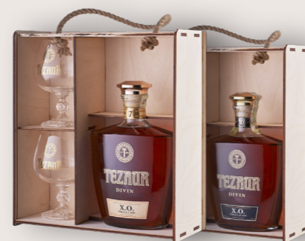
DIVIN TEZAU SET + 2 BOHEMIA GLASSES