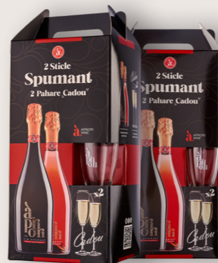
APRIORI WINE SET 2 BOTTLES + GIFT 2 BOHEMIA GLASSES