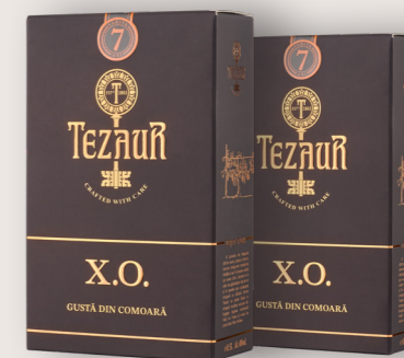
DIVIN TEZAU SET GIFT EDITION